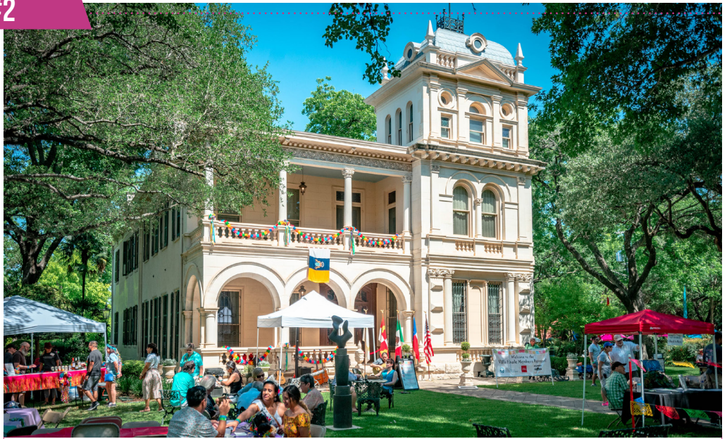
VILLA FINALE DURING THE 2019 KW FAIR

For those Francophiles out there, Villa Finale has a real treat. Three rooms of the mansion are packed with Napoleon memorabilia! You can even come face to face with the death mask of the French emperor – if you dare! For those in search of local delights, Villa Finale also boasts a beautiful collection of Robert and Julian Onderdonk paintings, as well as a large collection of early Texan and 19th century American furniture and antiques.