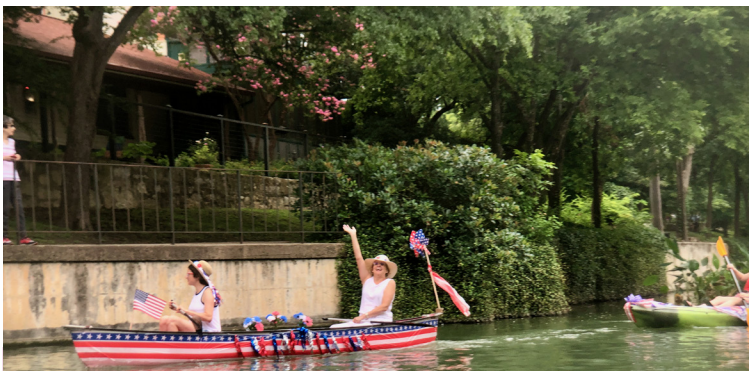
REGATTA PARTICIPANTS WAVING TO THE CROWD IN 2019