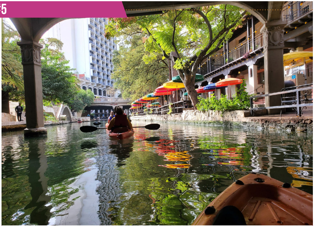
URBAN KAYAKERS ENJOYING THE RIVER WALK THE LOCAL WAY

The second adventure everyone should try is an electric bike tour of San Antonio's Historic