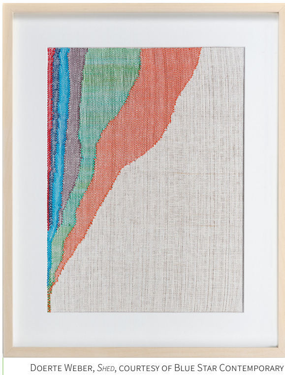
DOERTE WEBER, SHED